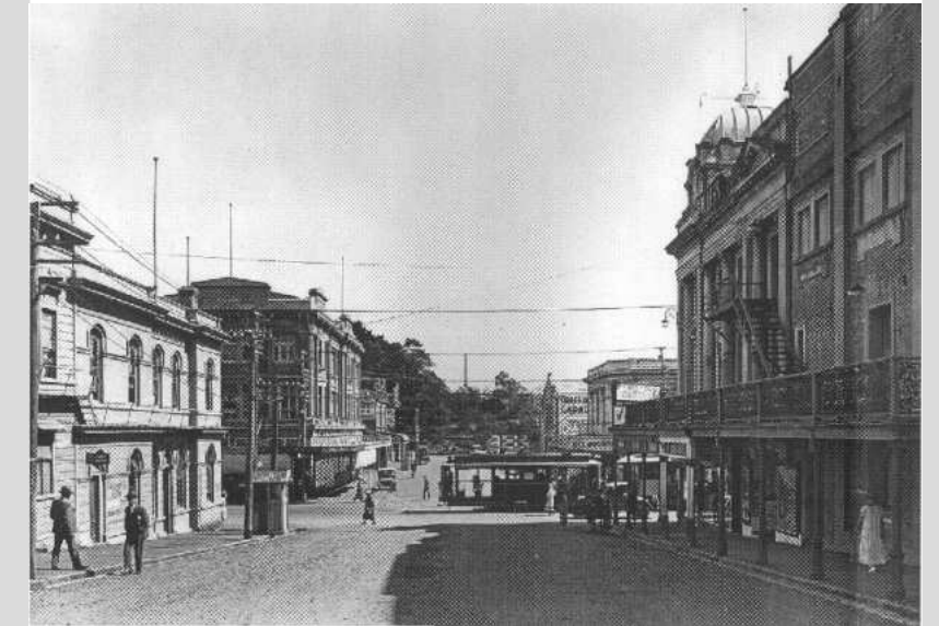
What Wanganui looked like in the old days.