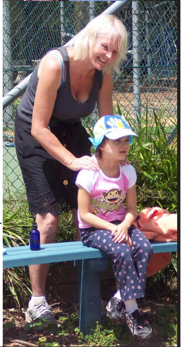
November Trade Day Pics